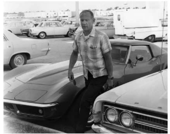
Edwin "Buzz" Aldrin and his 1969 Corvette

In 1969, Apollo 12 astronauts Dick Gordon, Charles Conrad, and Alan Bean were so smitten with the Corvette they all ordered custom 390hp 427 Stingray Coupes made with a gold-on-black color scheme designed by Bean himself.