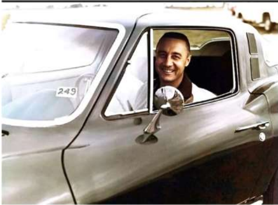
Virgil "Guss" Grissom in his C2

When Chevrolet offered him the lease deal, Glenn used it to buy a Chevrolet Station Wagon for his family.