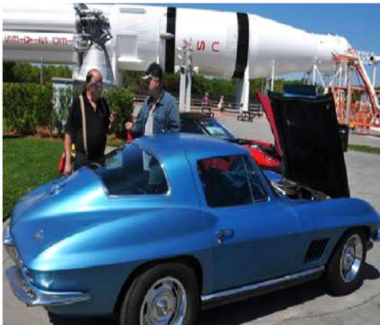
Neil Armstrong's 1967 427 Corvette