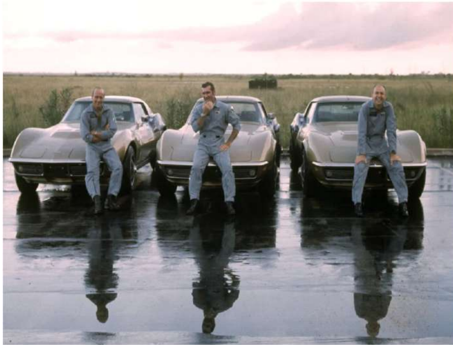
Down on the Cape