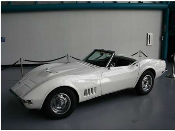
Alan Shepard's Corvette Roadster is on display in the Saturn V building at the Kennedy Space Center Visitor's Center.