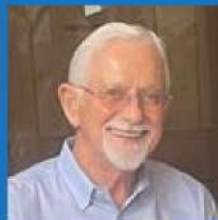
Governor Gary Doggett